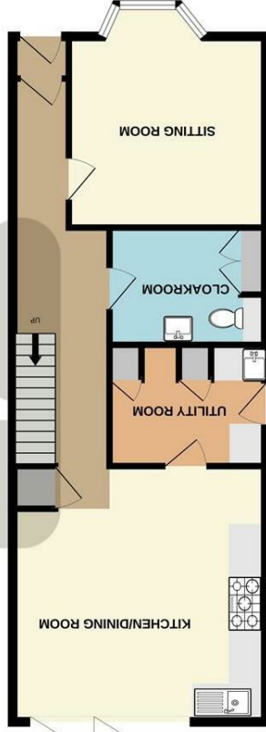
GROUND FLOOR 650 sq. ft. (60.2 sq. m.) approx.

What every agent has been made to ensure the accuracy of the layout contained here, measurements are taken to the best of their ability. This plan is for information only and should be used as a guide only. Prospective purchaser. The services, systems and appliances shown have not been tested and no guarantee is given as to their operation or efficiency. Call the agent.